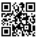
QRCode for Giving