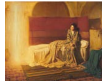
Henry Ossawa Tanner, "The Annunciation," 1898