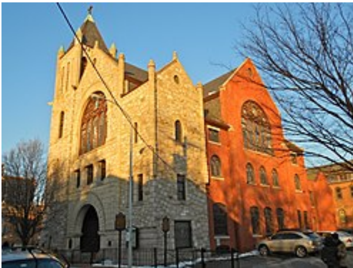
Mother Bethel African Methodist Episcopal Church Founded 1794