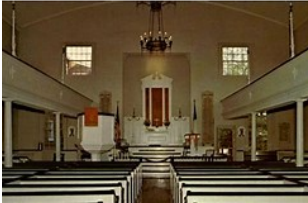
St. George's United Methodist Church Philadelphia, PA Founded 1769