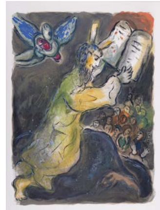
The Ten Commandments, Marc Chagall 1966