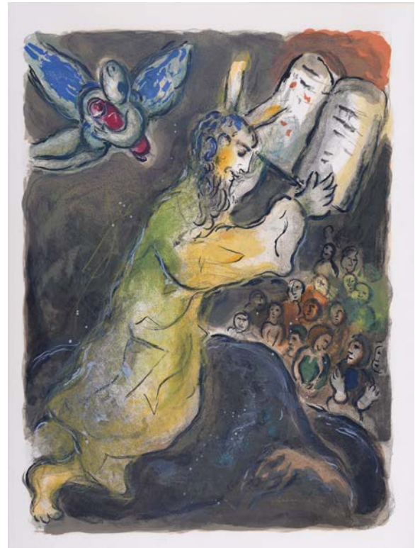
The Ten Commandments, Marc Chagall 1966