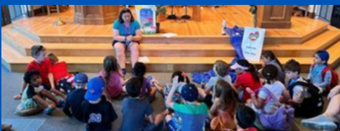
Vacation Bible School