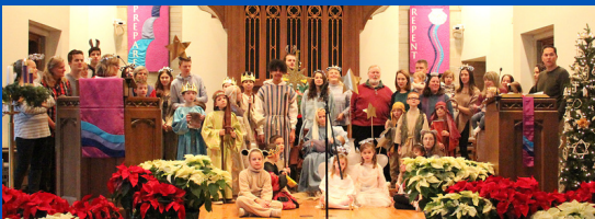
Christmas Pageant with 24 Participants

Worship Participation: Total Increased 5% Shifted to More In-Person