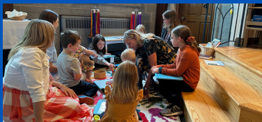
Grace Space Introduced

CPC Kids' Academy Earned Coveted NAEYC Accreditation