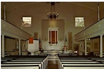
St. George's United Methodist Church Philadelphia, PA Founded 1769