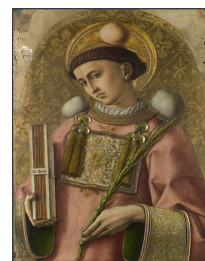
Saint Stephen by Carlo Crivelli

25th Anniversary of Stephen Ministry at CPC