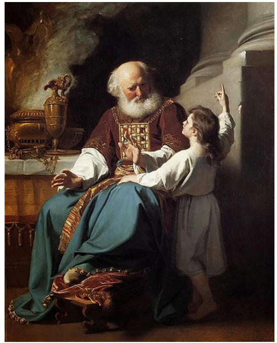
Samuel Relating to Eli the Judgment of God by John Singleton Copley