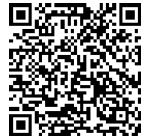
QR Code for Registration

Teams will be randomly assigned unless you register a guest who will then be placed on your team. Please pay the small registration fee online or by check at the church office. All fees are part of a fundraising effort for our CPC Youth Summer Caravans or short-term mission trips. Admission is $10 per person; $25 max for families. All proceeds will go to the Youth Mission Caravan fund!