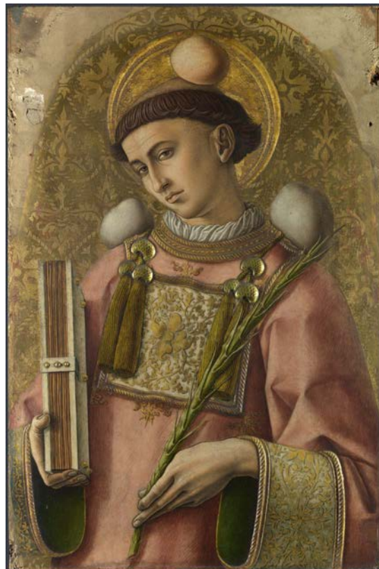
Saint Stephen by Carlo Crivelli, 1476 From the Demidoff Altarpiece